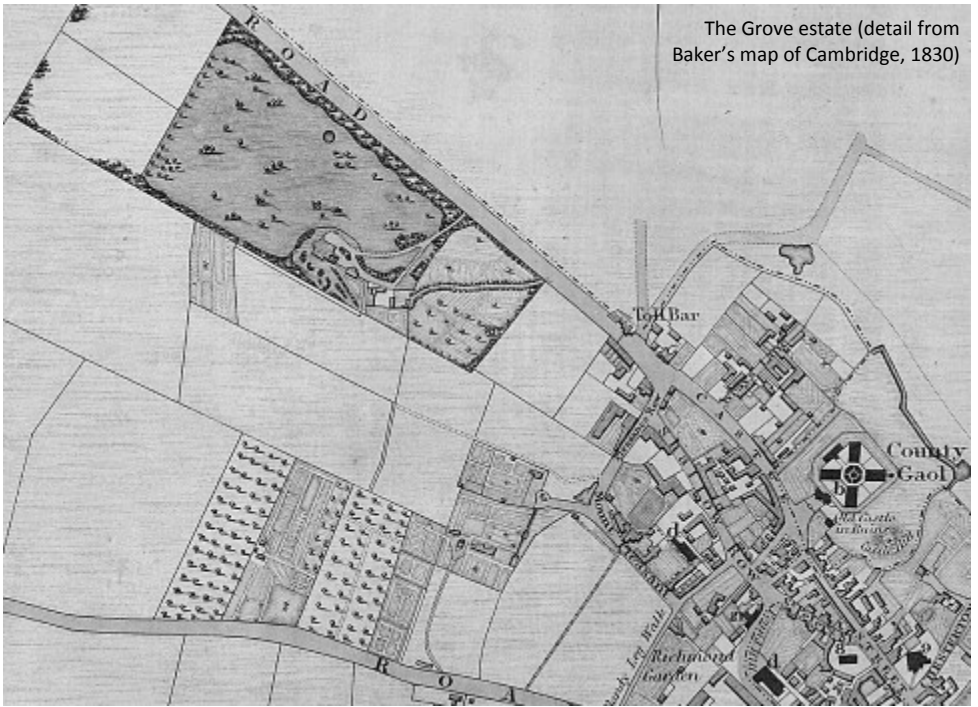
The Grove estate (detail from Baker's map of Cambridge, 1830)