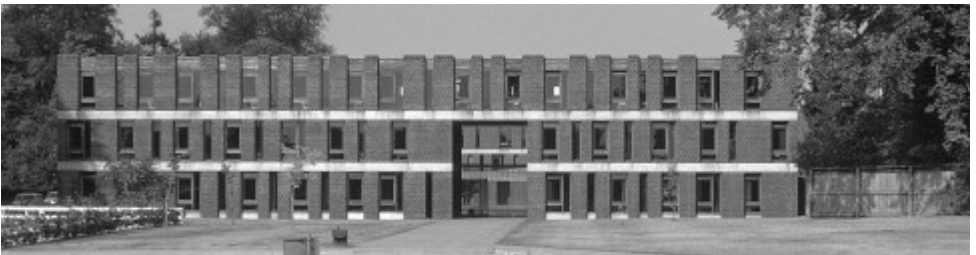
The south range in 1974, with the original College entrance and gates; the boundary fence of The Grove is on the right.

A close look at the buildings and their complementary gardens shows Fitzwilliam evolving into one of the most appealing of Cambridge college environments in which to live and to study.