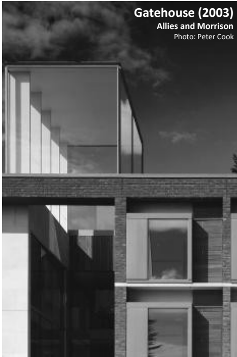
Gatehouse (2003) Allies and Morrison