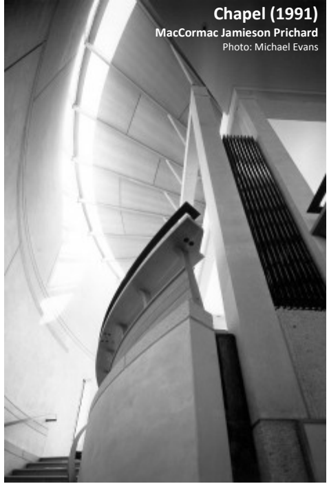
Chapel (1991) MacCormac Jamieson Prichard