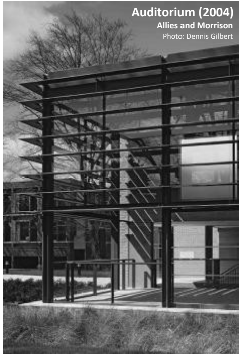
Auditorium (2004) Allies and Morrison