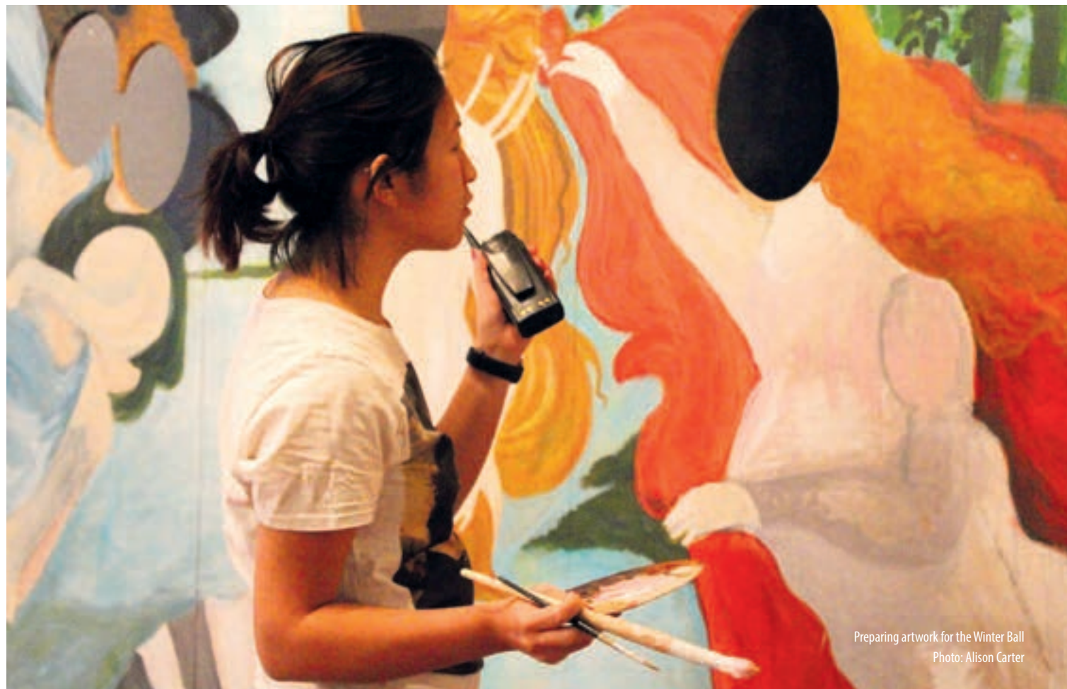
Preparing artwork for the Winter Ball