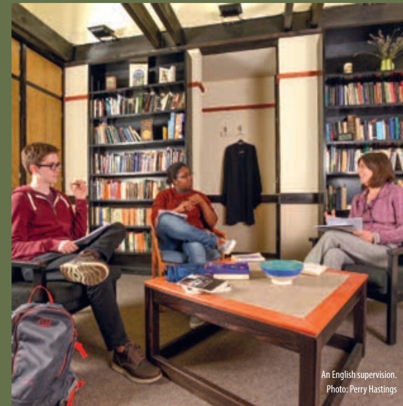
An English supervision.

At Fitzwilliam we pride ourselves on our high levels of academic support and we cater for all subjects. Our Directors of Studies are very dedicated, and we offer support in acquiring study skills throughout the degree. The courses themselves are often supplemented by events, trips, and talks put on by subject societies.