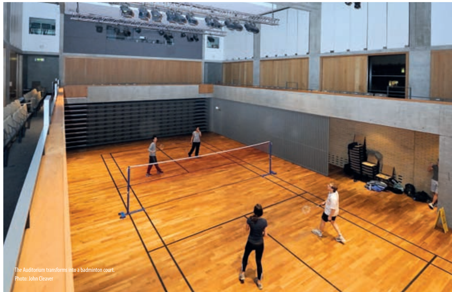
The Auditorium transforms into a badminton court.