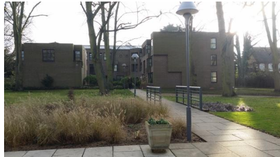
View from the Gatehouse Court to the Wilson Court