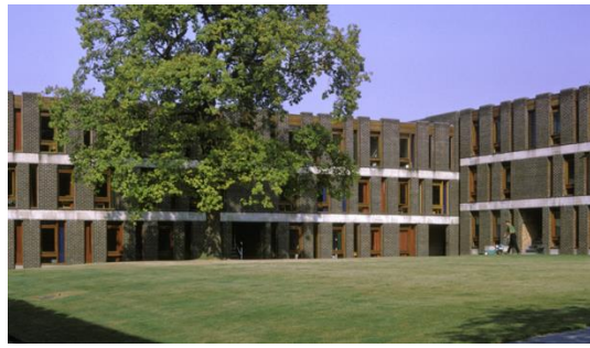
View to the Tree Court