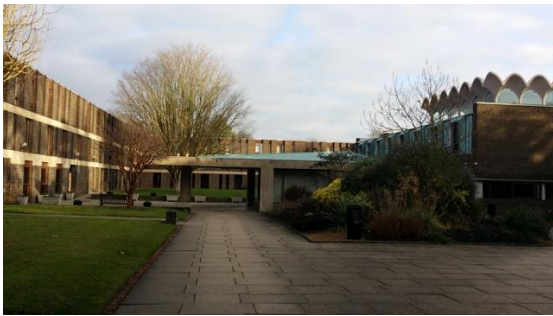
View to Follows' Court