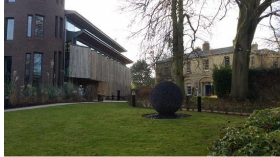
View from the Tree Court to the Grove