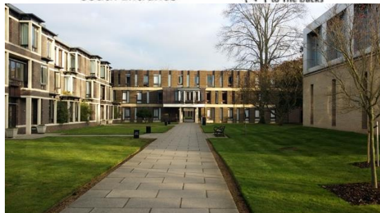
View to the New Court