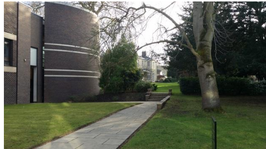
View from the New Court to the Grove