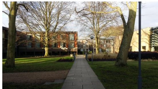
View from the Wilson Court to the Gatehouse Court